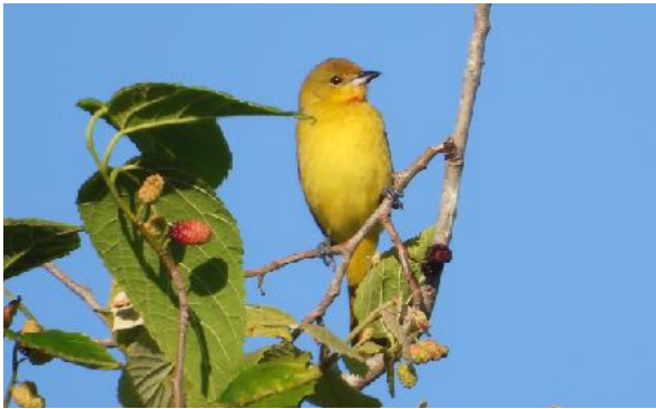
Baltimore Oriole at the Mulberry Patch