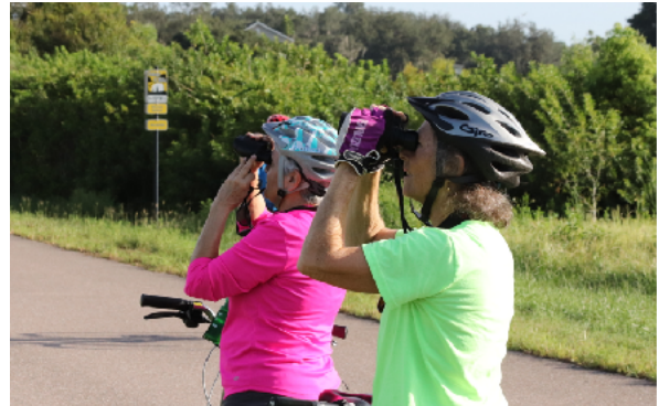
Enjoying the Experience