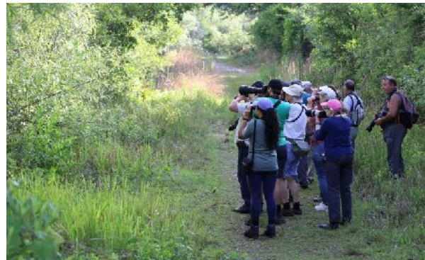
Group at Aripeka Sandhills Preserve