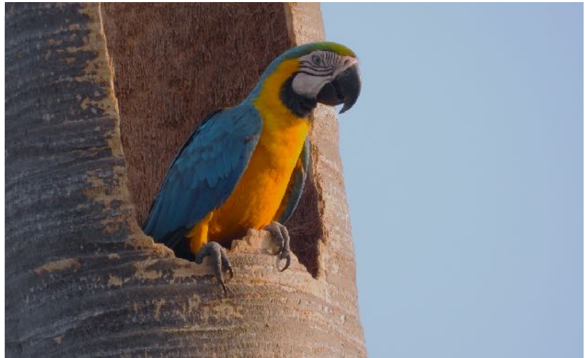
Blue and Yellow Macaw by Klenisson Brenner

Field Trip to Honeymoon Island, starting at 8am