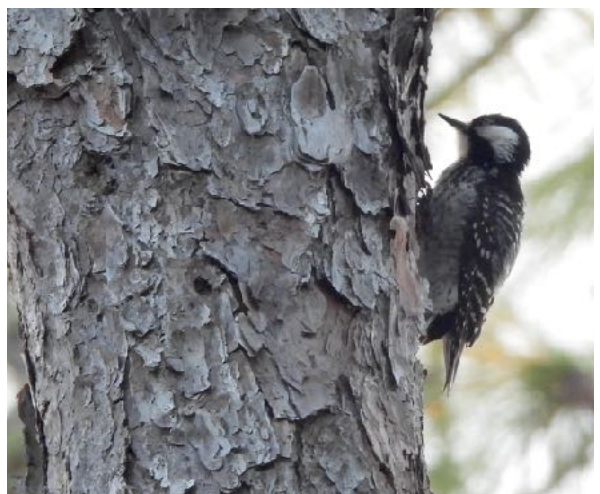
Red-cockaded Woodpeckers at Croom