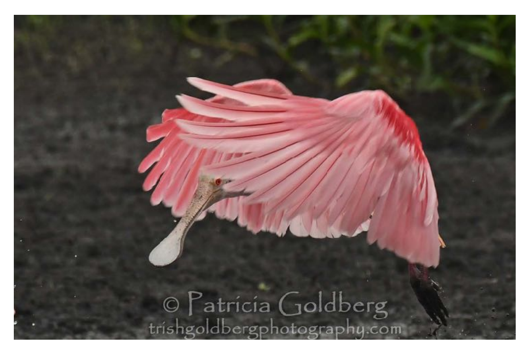
Photography Workshops Are Back by Request!