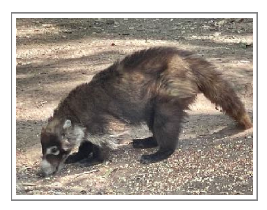
Coati