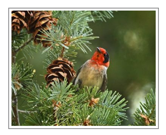
Red-faced Warbler by Pat Goldberg