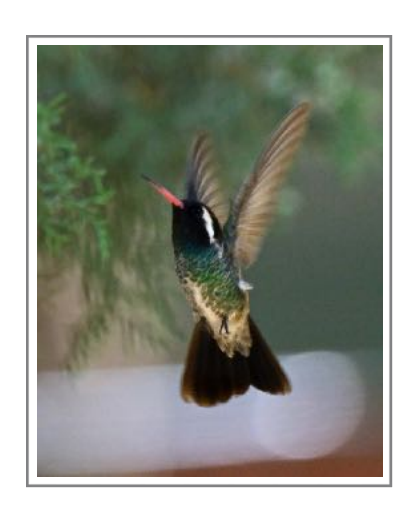
White-eared Hummingbird

Warbler, the Western Flycatcher, and Mexican Chickadee amongst others. Higher and higher we drove to our next stop, Barfoot Junction, where we got our first glimpse of the Steller's Jay, a very cooperative Pygmy Nuthatch, Western Bluebirds and the sole Greater Pewee of our trip. Then on to Rustler Park where we heard the Olive Warbler and an unexpected bonus was a flyover flock of a half dozen Red Crossbills as we walked back down to our vehicles.