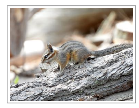
Cliff Chipmunk