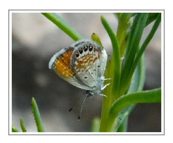
Western Pygmy Blue by Don Fraser