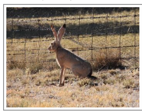
Black-tailed Jackrabbit