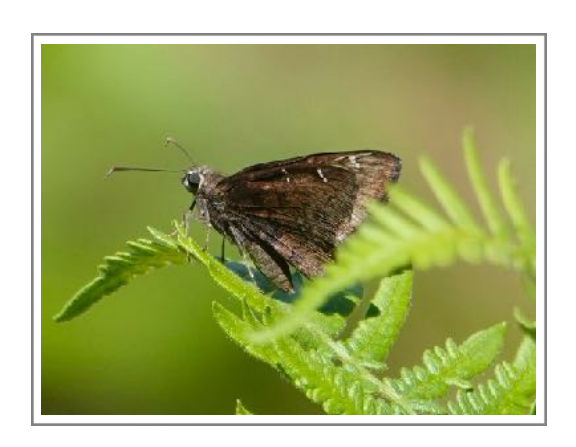
Northern Cloudywing