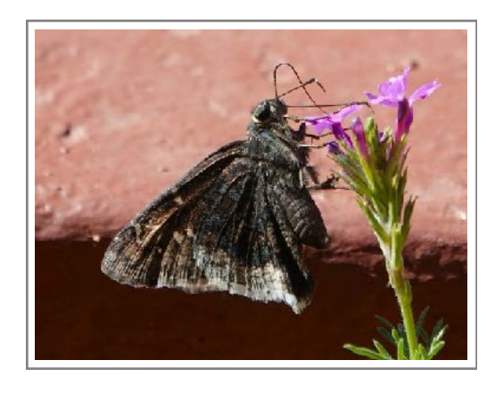
Desert Cloudywing by Don Fraser

See a full list of butterflies seen and additional photographs on the next page.