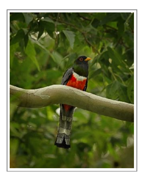
Elegant Trogon by Pat Goldberg