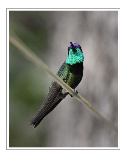
Rivoli's Hummingbird