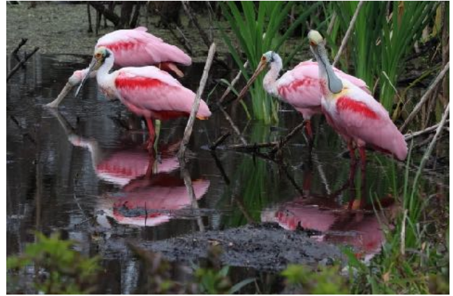
Roseate Spoonbills

With cool temperatures, an overcast day with a chance of showers and Alligator Alley temporarily out of commission, many of our regular birders decided to skip this trip this year, and there were just 7 of us on the day. But those of us who made the trip to Polk County were well rewarded for our efforts.