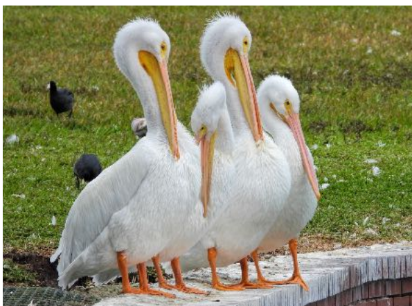
American White Pelicans