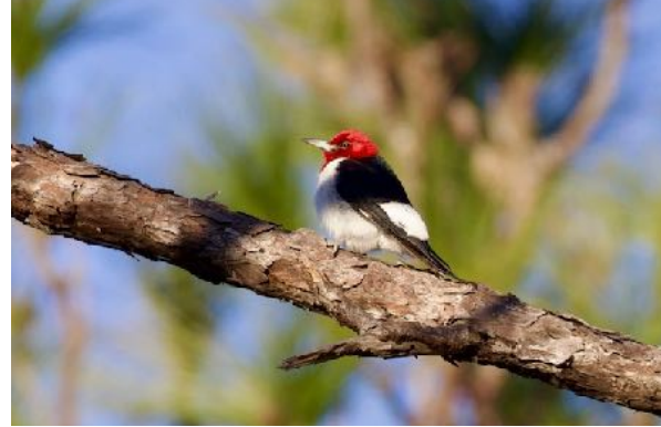
Red-headed Woodpecker