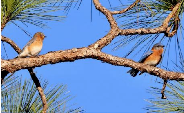
Eastern Bluebirds by Bob Burkard