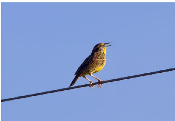
Eastern Meadowlark

I have ridden this trail many times and I never get bored with the search for the species of birds that I observe in this area. Song Sparrows, Lincoln's Sparrows, Savannah Sparrows, and Swamp Sparrows were recorded by local birders on eBird over the last few weeks. This is also a terrific location for seeing Bald Eagles, American Kestrels, and Eastern Meadowlarks. eBird reports that there are 83 different species were observed in the last 30 days.