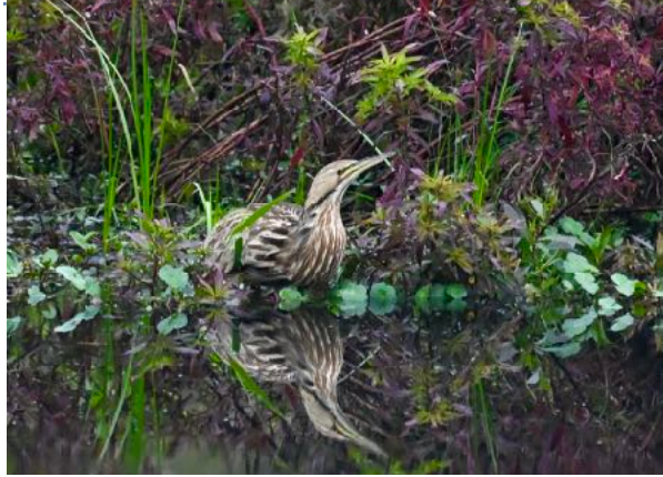
American Bittern