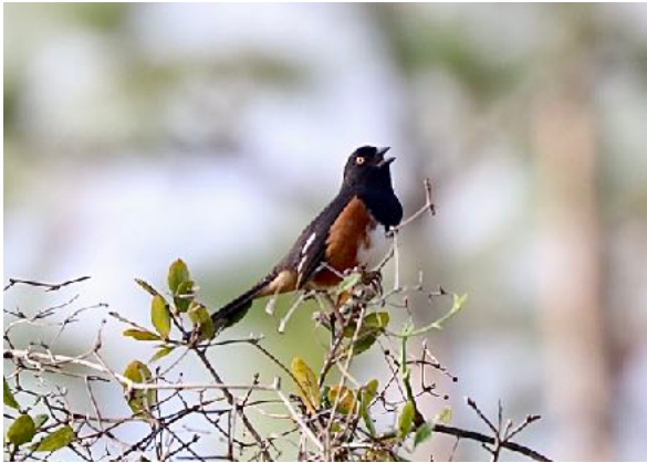
Eastern Towhee

The weather was perfect. Funny, even though we observed hundreds of birds, it was strangely quiet with not a lot of singing.