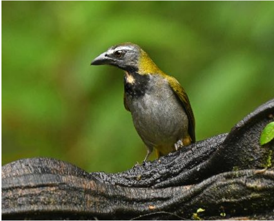
Buff-throated Saltator by Pat Goldberg