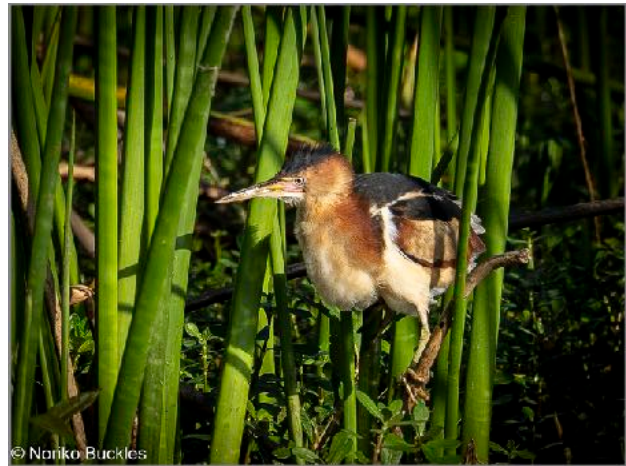
Least Bittern by Noriko Buckles

On March 15th a group of 17 of us set out on our Celery Fields field trip. It was a beautiful day with blue skies, and we were very fortunate to see over 50 species of birds. Thanks to the Sarasota Audubon docents, who staffed the Raymond St. boardwalk for their help. Giving us good looks on the day were the Gray-headed Swamphen, Purple Gallinule, Black-necked Stilts, and numerous Blue-winged Teal. We were also able to see some of the more reticent marsh birds including Least Bittern and Sora.