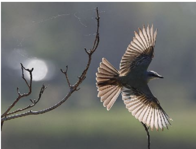
Tropical Kingbird