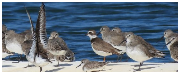
Dunlin, Western Sandpiper and Semipalmated Plover at SunWest on February 10, 2024

The Green Key (Robert K. Rees Memorial Park) survey on Tuesday February 11th yielded only a handful of gulls and terns - no shorebirds at all. Hudson Beach Park on the 13th was little better, but did have a solo Black Skimmer.