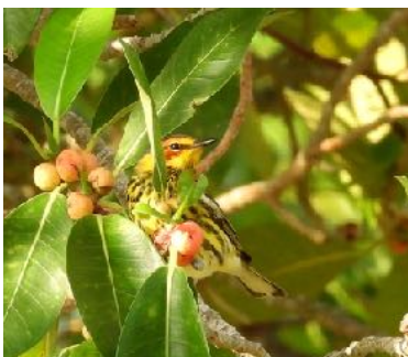
Left: Cape May Warbler

As you probably know, Fort De Soto was hit very hard by hurricanes last season and was closed for many months, reopening in stages. Kimberly and I (Christine) took a scouting trip to see what it now looks like. While extensive damage is evident - particularly in the trails off the Bay Pier parking lot, almost everything (including restrooms) is open. Vegetation looks sparse in areas we are accustomed to seeing lush foliage. On an optimistic note, we saw the first hints of migrants coming through and still anticipate seeing a good range of species on the day. For a clearer idea of what you might expect to see, visit our eBird list from last year's trip at https://ebird.org/checklist/S169682548 .