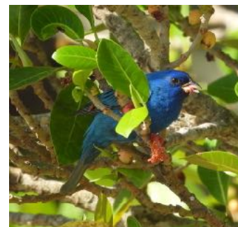
Right: Indigo Bunting