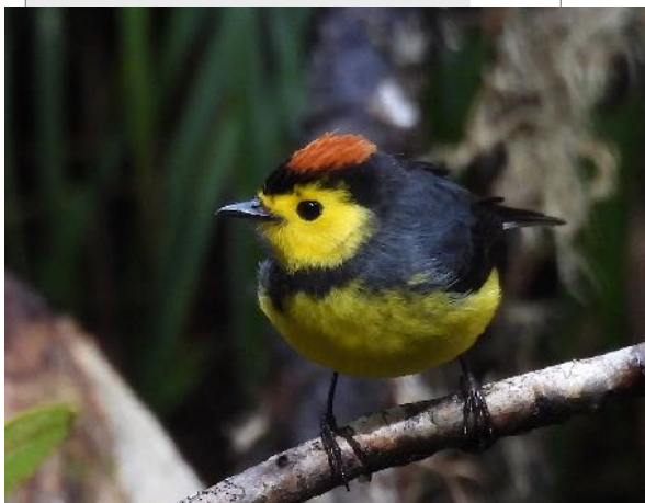
Collared Redstart

Where? Starkey Environmental Education Center, Starkey Park