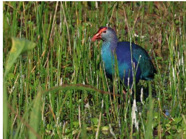
Gray-headed Swamphen