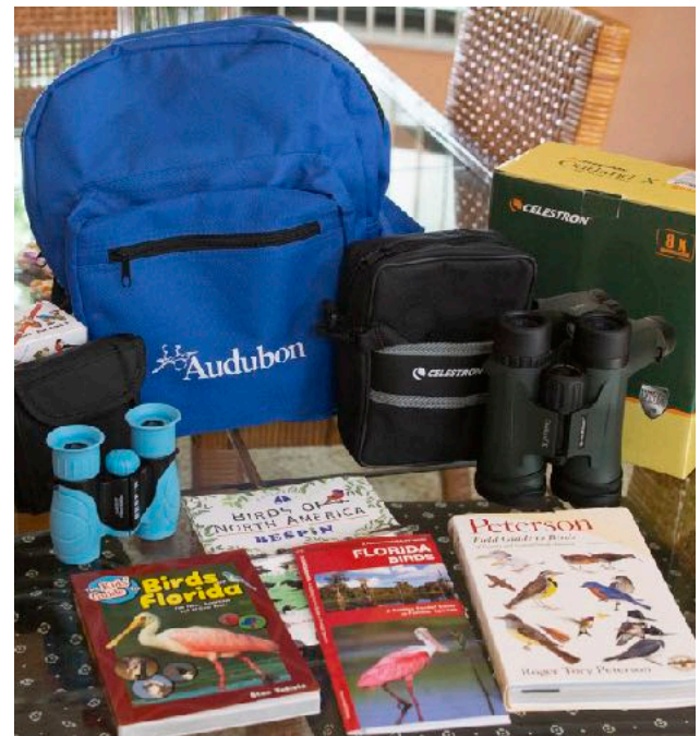
Backpack with contents

Thirteen Birding Backpacks were provided to the Pasco County Library system by early 2023. We recently learned that during 2024, these 13 backpacks were checked out 57 times and renewed for another 65 times. During this time only one backpack was returned missing an Identification book, which the library quickly replaced. We were really happy to learn that the backpacks are being well used, and wanted to share the good news with you.