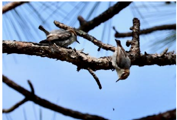
Brown-headed Nuthatches