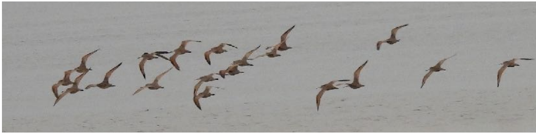
Marbled Godwits at Fred Howard Park, 2-07-25