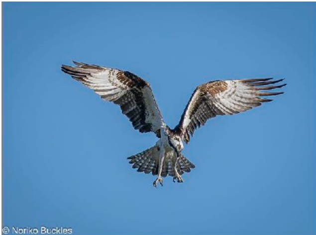
Osprey by Noriko Buckles