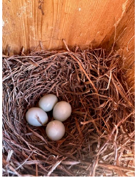
Nest Box with 4 Eastern Bluebird Eggs