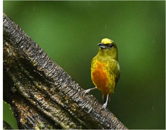
Olive-backed Euphonia