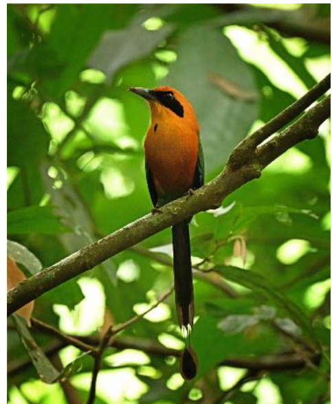
Rufous Motmot by Pat Goldberg