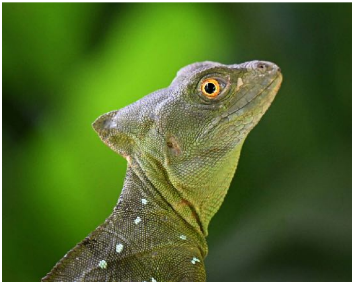
Green Basilisk

If you think you may be interested in either of these trips, please let me know at president@pascoaudubon.com , and I will keep you apprised when the webpages with full details are available for each trip, along with the dates that registration will open. We predict that both trips will fill quickly.