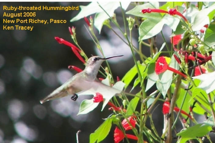
Ruby-throated Hummingbird August 2006 New Port Richey, Pasco